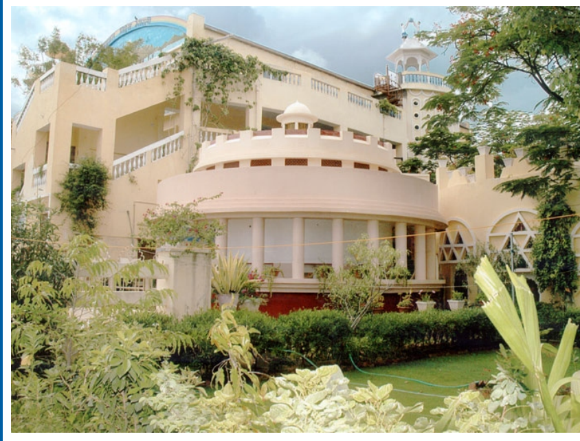
A view of the Children's Peace Palace, Rajsamand (India)

7 th INTERNATIONAL CONFERENCE ON PEACE AND NON-VIOLENT ACTION